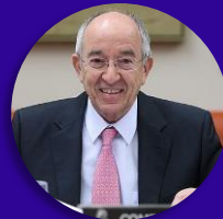
Miguel Ángel Fernández Ordóñez Former Governor of the Bank of Spain